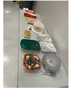
Dessert table from the Ethnic Dinner